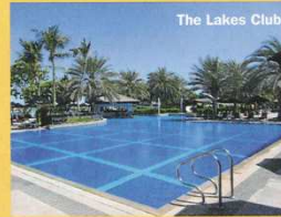
The Lakes Club

Annual membership available. From Dhs20 per class (members). Open 6am-10pm daily. The Lakes Club, www.fitnessfirstme.com (04 438 0338).